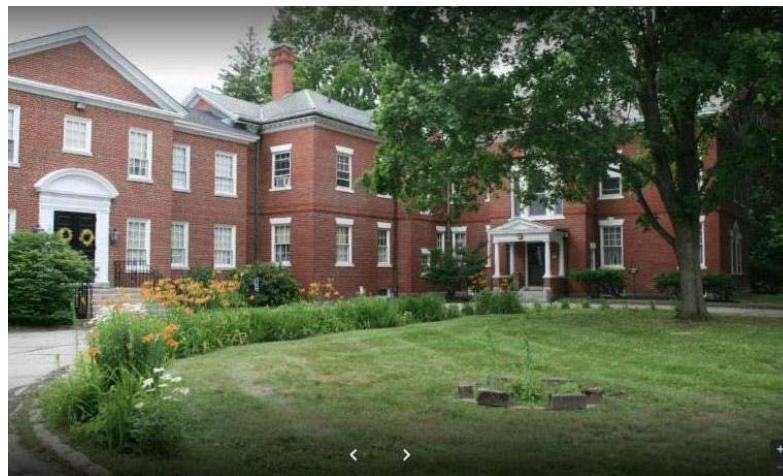
The Manning House